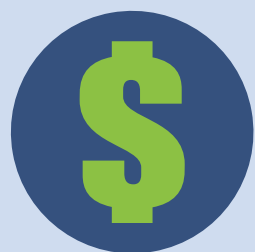
SILVER PLAN COST $215