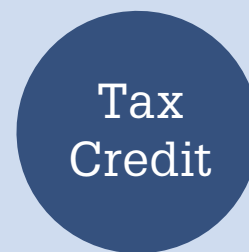
TAX CREDITS TO HELP NELLY PAY HER PREMIUM $115