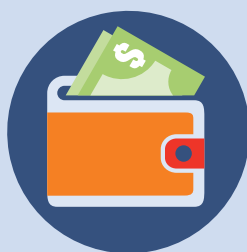
NELLY'S PREMIUM LIMIT $100