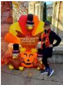
LiveWell Fit participant after completing the Tacky Turkey Sweater 5k in Seattle.

Option of: Reimbursement of fitness tracking device/watch* or running/biking shoes up to $170