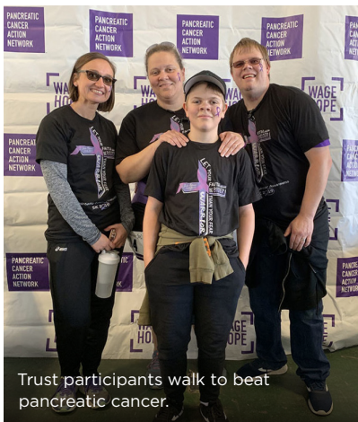
Trust participants walk to beat pancreatic cancer.

Earn funds for your HRA with LiveWell Fit. See the full list for details.