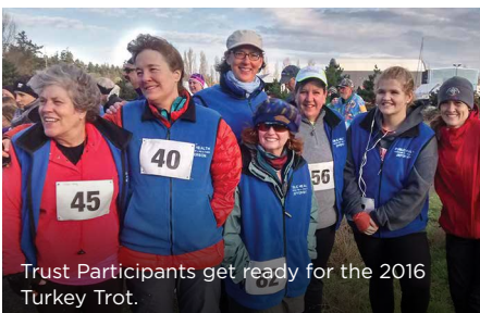
Trust Participants get ready for the 2016 Turkey Trot.

Earn funds for your HRA with LiveWell Fit. See the full list for details.